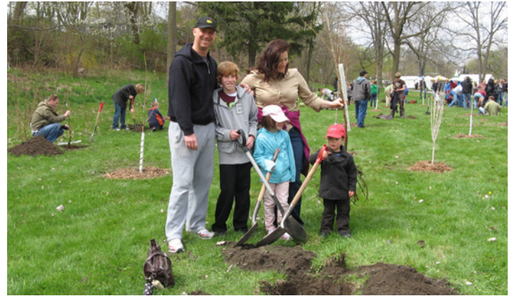
Earth Day London is always a popular community event.

School yards, public parks, river corridors, conservation areas and private landowners in London, Stratford, St Marys, Ilderton, Beachville, Woodstock, Dorchester, Thorndale, Salford and Lucan