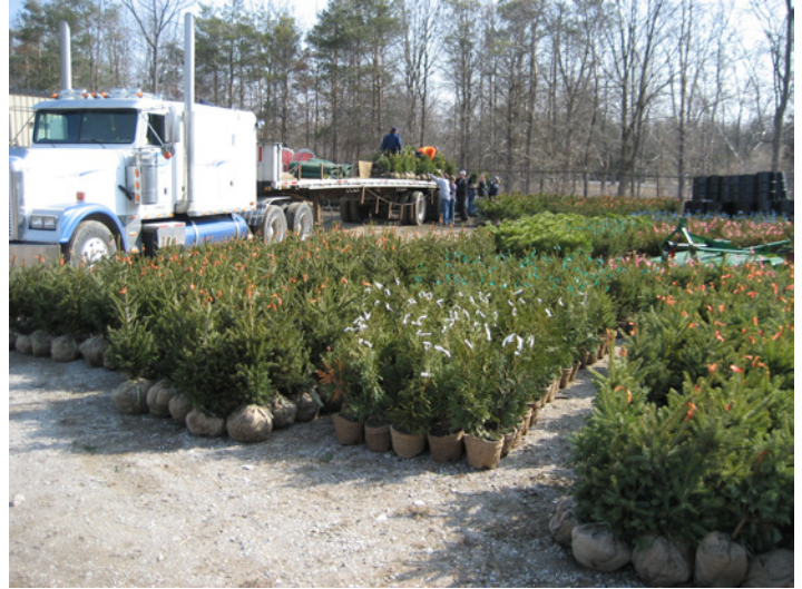
The arrival of the trees in April is a busy time for forestry and CA staff.

The Communities for Nature program will also contribute, planting nearly 10,000 native trees and shrubs.