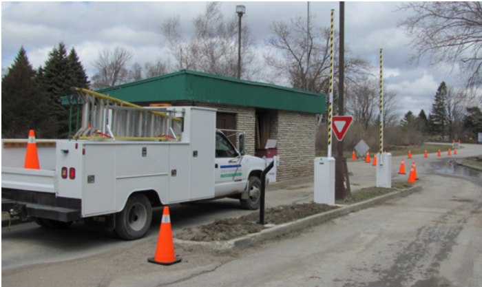
The newly installed gates and swipe card reader at Fanshawe CA.