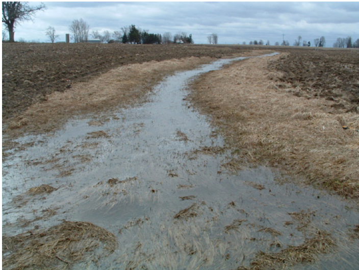
This grassed waterway was installed through the CWP to protect the farm field from soil loss during spring snowmelt and rainstorm events.