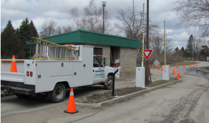
The newly installed gates and swipe card reader at Fanshawe CA.