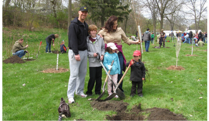
Earth Day London is always a popular community event.