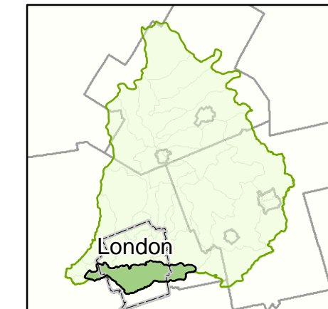
Watershed Key Map