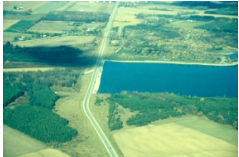
Conifer plantings near Wildwood Reservoir